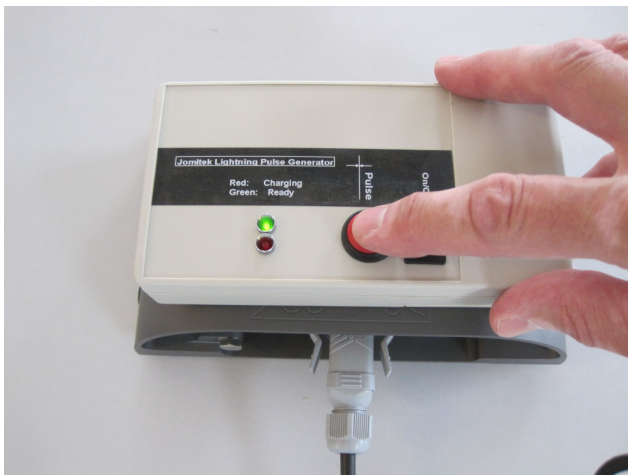
Lightning test generator on top of sensor.