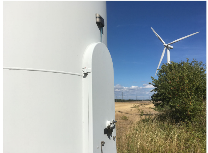
Sensor mounted above wind turbine door