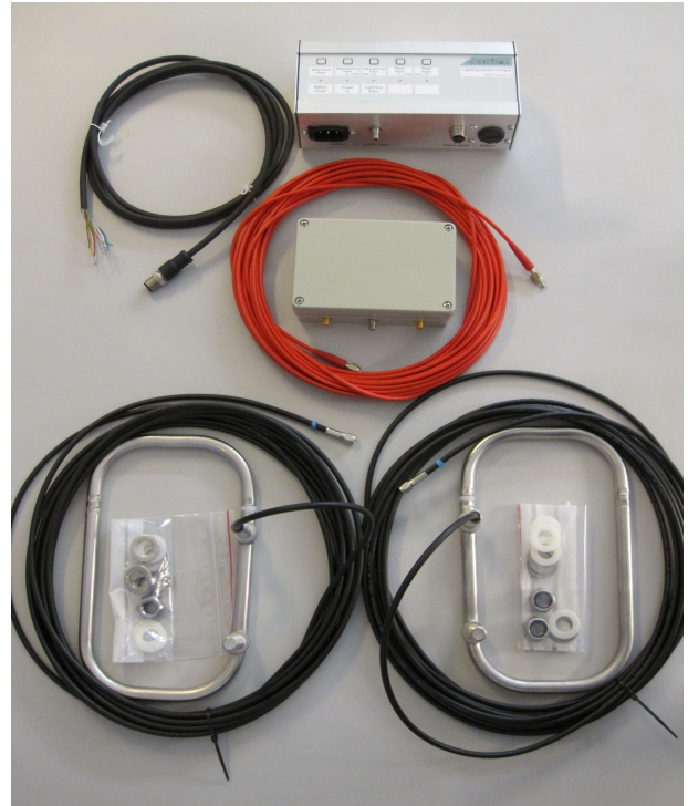
Classic sensor system

The antennas send the lightning generated signal to the inside antenna box. This box converts the antenna signals to an optical signal that is received by the control box. The control box gives the alarm to the turbine control. The turbine control resets the alarm signal