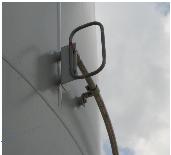
Antennas at bottom of tower