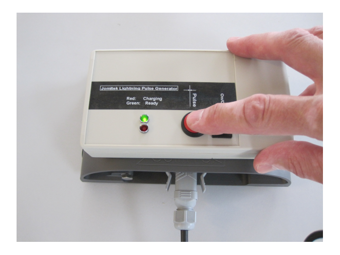
Lightning test generator placed on top of the sensor.